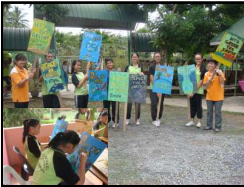
PHOTO 8: Value Education; 'Educating the Young'. Students draw posters and signboards with the message of 'Love the Environment', as a way to instill the love towards the environment amongst young children and spreading the message of loving the environment into the community.