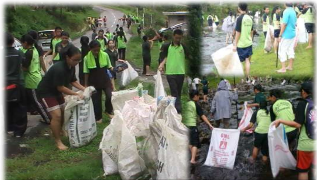
PHOTO 3 : Students, teachers and the community work hand-in-hand to clean up the Moyog River and the adopted residential areas.