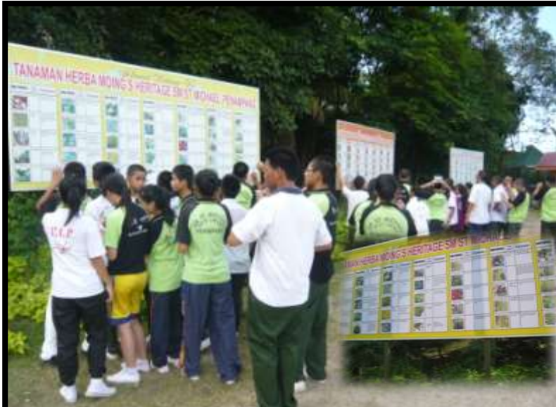
PHOTO 9: Value Education; 'Learning Station Anywhere, Anytime': Signboards with information on herbs and their uses are placed near the Herbs Garden to provide information there and then to students and visitors to the school. It also functions as a learning station where resources are available at an