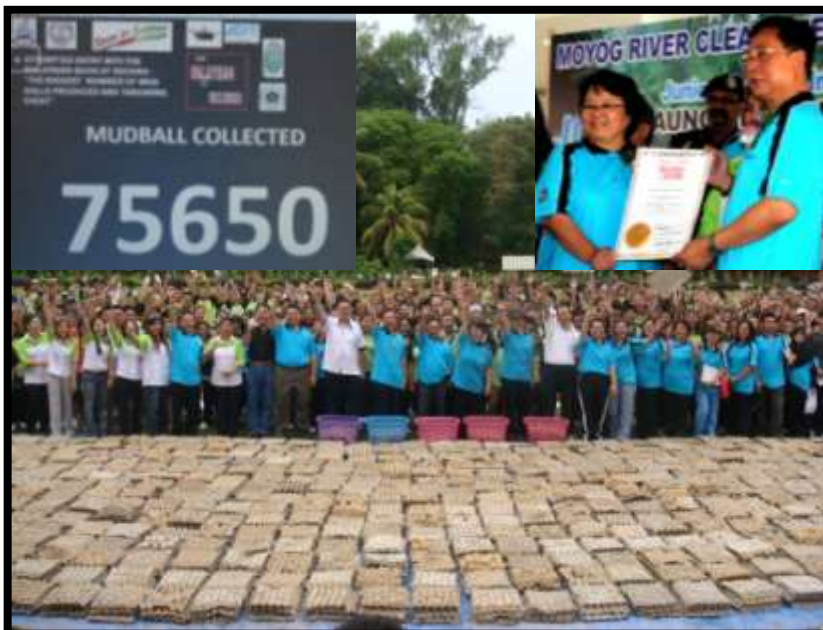
PHOTO 10: Value Education; 'Save Our River and Drains'. The school's attempt entry into the Malaysian Book of Records has succeeded in getting its students, teachers and non-teaching staff to produce 75650 mud balls which is used to treat the river and drains near the school. Making mud balls is only the activity but the message and knowledge on water conservation and protecting the rivers and drain gained during the process is priceless.