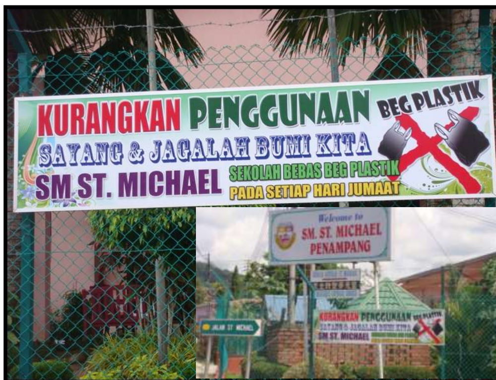
PHOTO 6 : A signboard placed in front of the school printed in Malay Language that claims; “Reduce the use of plastic bags. Do love and care our planet Earth. ST Michael Secondary School, a school free of plastic bags on every Friday.”