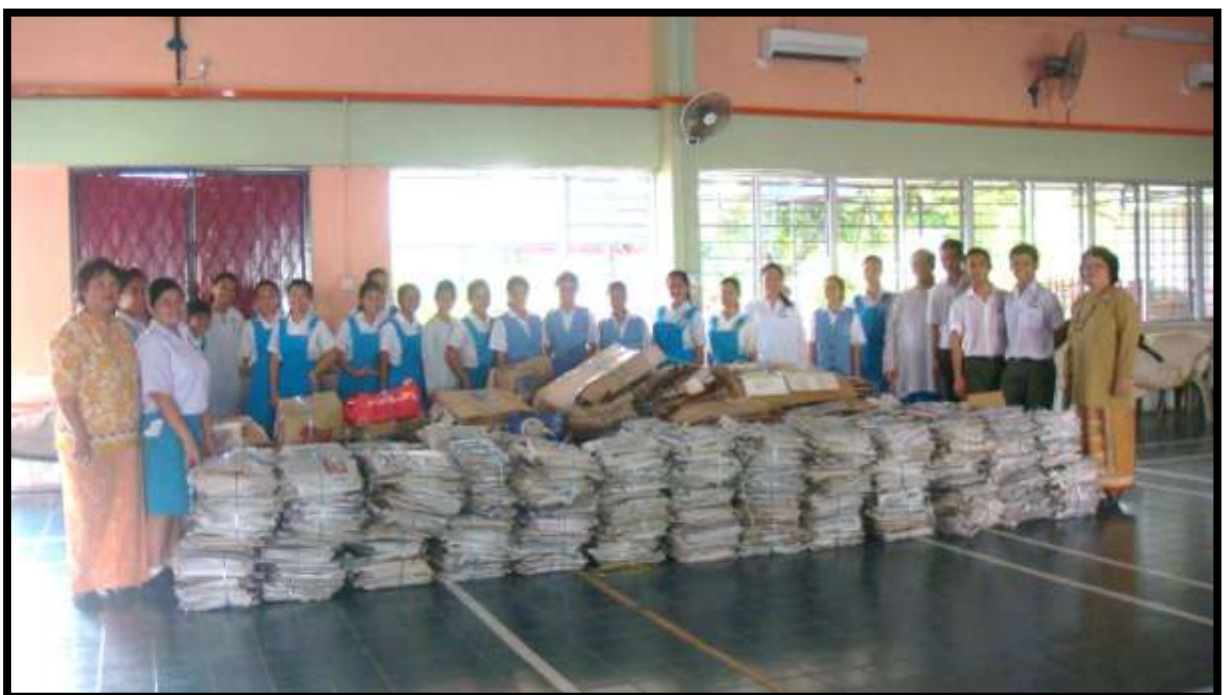
PHOTO 4 : Some of the old newspapers and cardboards collected by the students in conjunction with the school's Environmental Week.