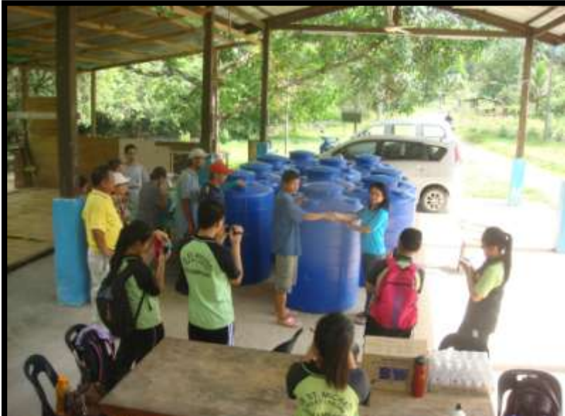
PHOTO 7: Value Education; 'From Heart to Hand'. Students raised fund in a project to buy water tanks to be donated to the villagers as one of the school's initiative to encourage them to collect rain water to be used for watering plants and crops, thus reduced their dependence on tap water and a cut on their water bills.