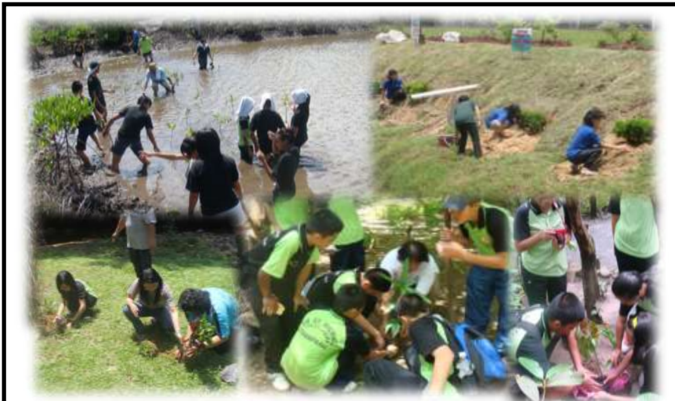
PHOTO 5: Values Education: Giving back to the environment. Students and teachers work together to plant mangrove saplings at the wetlands as well as other plants along its adopted areas and other places.